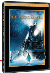
The Polar Express © Warner Bros. Entertainment Inc. All Rights Reserved.

1 Buy: 1 DVD of The Polar Express (on standard DVD, HD DVD, or Blu-Ray Disc) and 2 Sunmaid Raisin Items . (any 9 oz, 15 oz or 24 oz packages). Products must be purchased during the "offer period" of 10/1/07 - 10/31/08.